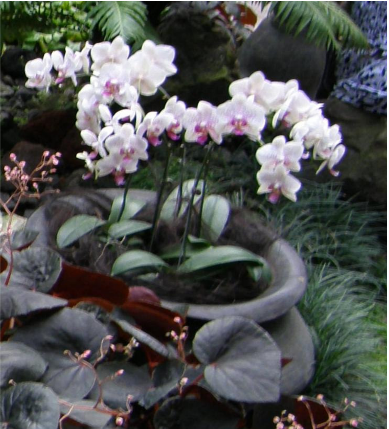
In the cool house, I had poor result with the Lumix at 4x zoom (I think because of poor light)