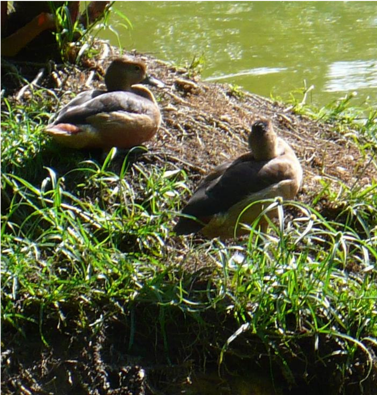
taken from about 20 feet away at 4x zoom; now 20x zoom