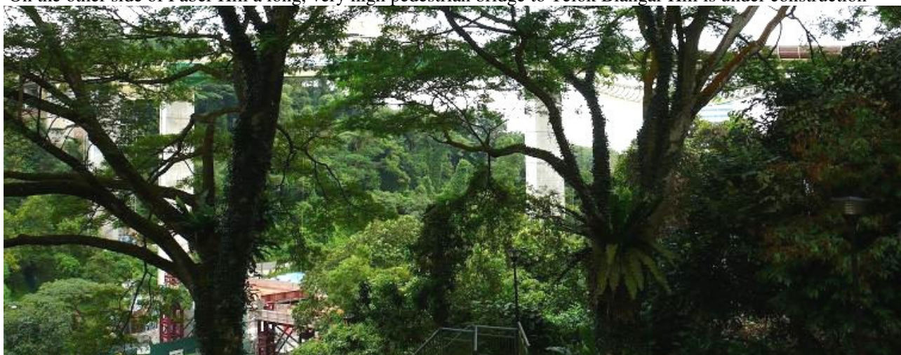
now some details