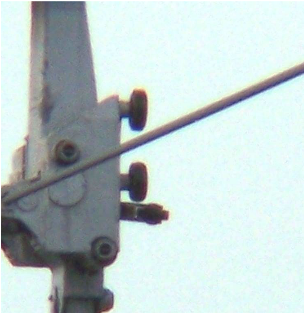
from a car approaching Faber Hill Station; one near PSA tower