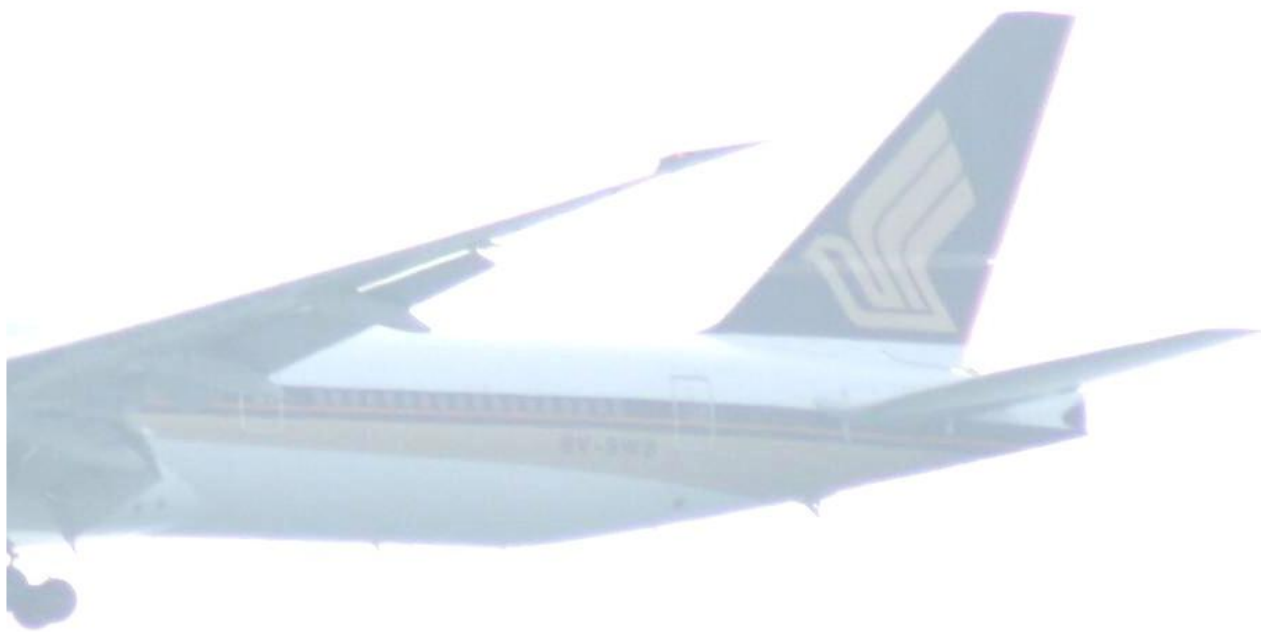
silk air and another plane descending over trees: