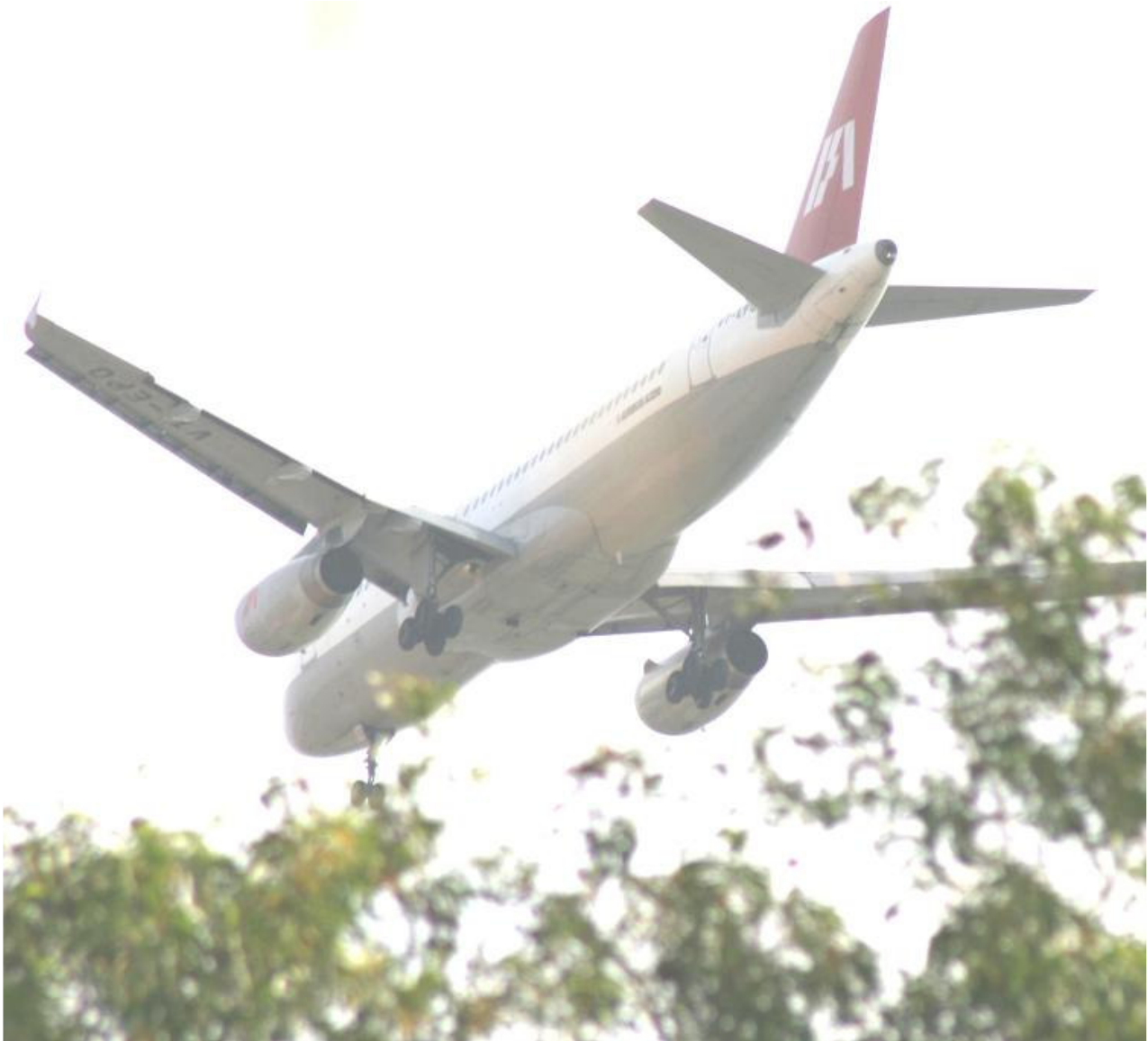
some parts of the plane as it flew overhead